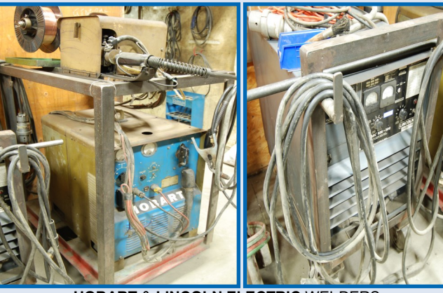
HOBART & LINCOLN ELECTRIC WELDERS