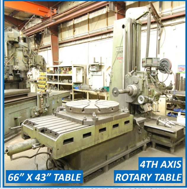
CINCINNATI GILBERT HORIZONTAL BORING MILL, MILLVISION 4-AXIS DRO, 66" X 43" TABLE, 40" ROTARY TABLE, 9" FACING PLATE, HYDRAULIC TANK, S/N 119