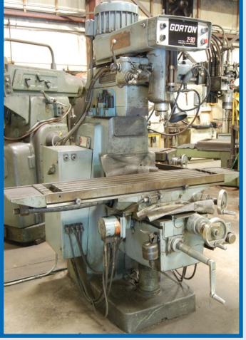
GORTON TRACE-MASTER MILL