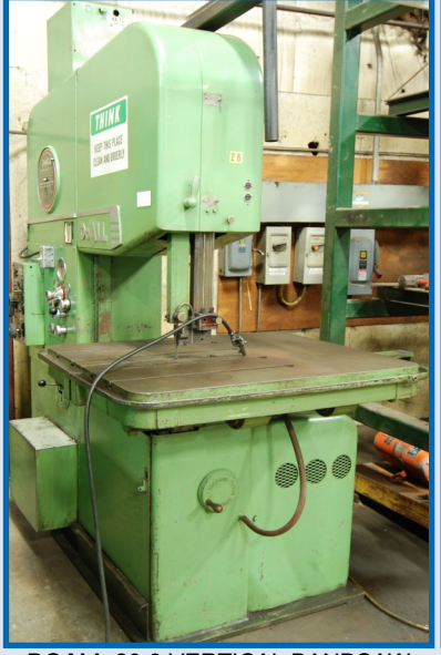
DOALL 26-3 VERTICAL BANDSAW