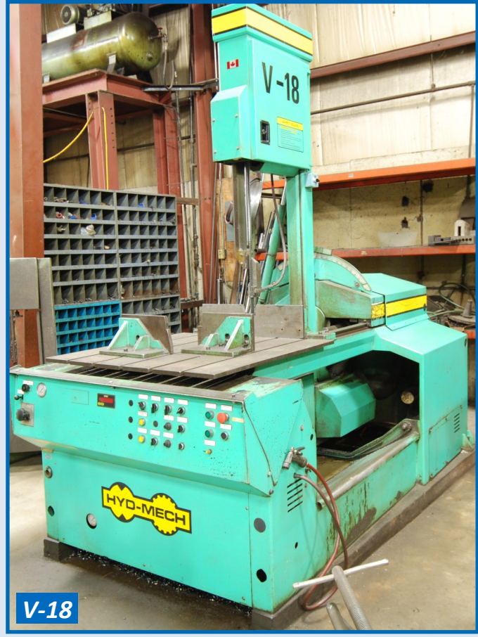
HYD-MECH SEMI-AUTOMATIC BANDSAW