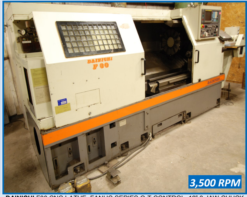
DAINICHI F30 CNC LATHE, FANUC SERIES O-T CONTROL, 12" 3-JAW CHUCK, 21.7" SWING OVER BED, 13.8" MAX MACHINING DIAMETER, 50" BETWEEN CENTERS, 3,500 RPM, 12-STATION TURRET, TAILSTOCK, S/N 23484