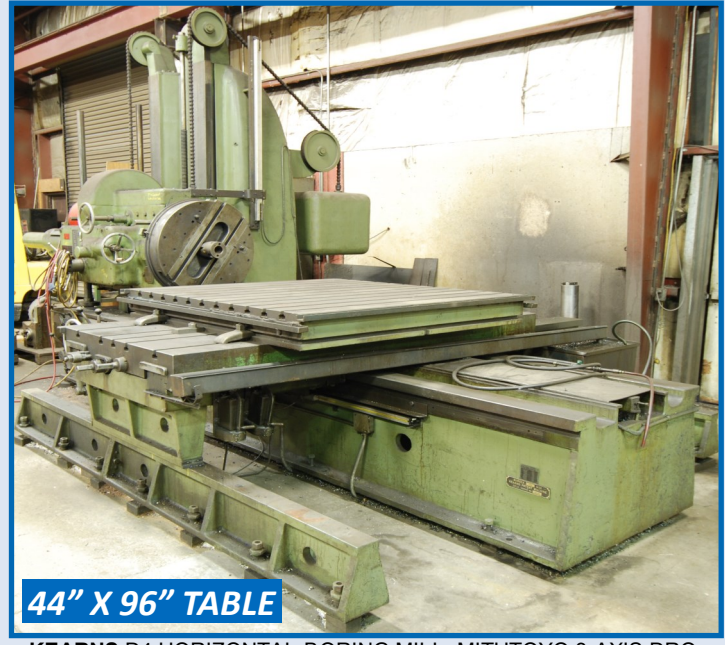
KEARNS D4 HORIZONTAL BORING MILL, MITUTOYO 3-AXIS DRO, 44" X 96" TABLE, 400 RPM, 6" SPINDLE, 32" FACING PLATE, HYDRAULIC TANK, S/N 4922