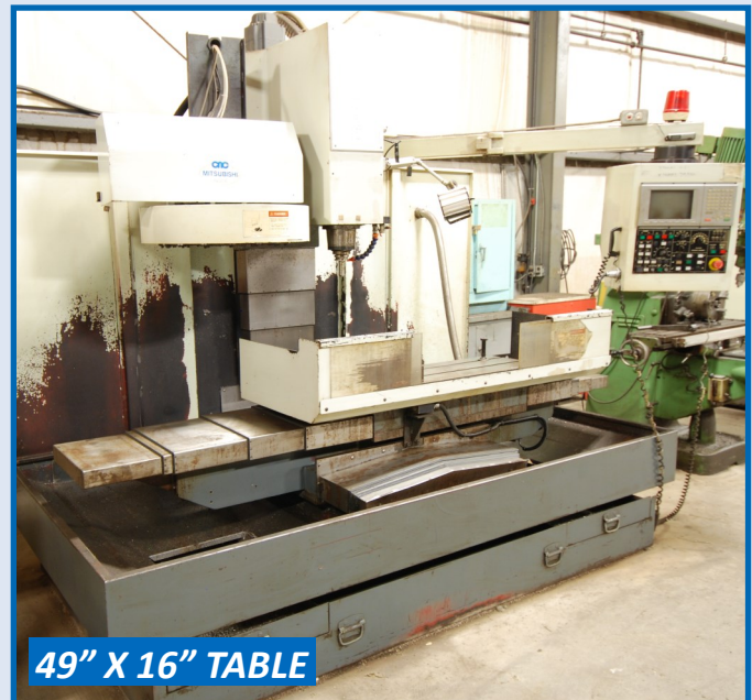
MITSUBISHI VMC-405 CNC VERTICAL MACHINING CENTER, MITSUBISHI CONTROL, 49" X 16" TABLE, 16 ATC, TRAVELS: X-39.58", Y-18.89", S/N C405-101