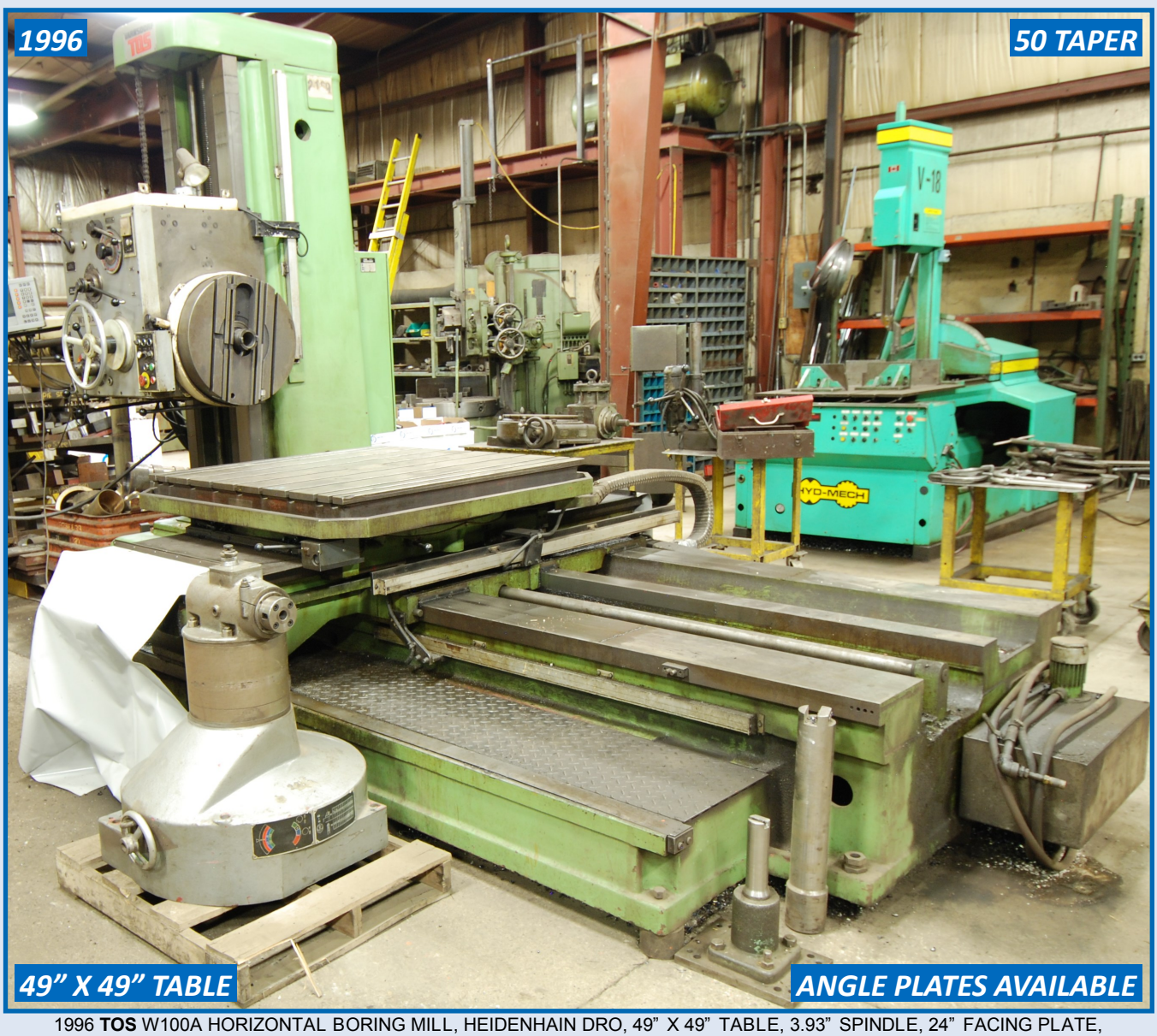
TRAVELS: X-63", Y-44", Z-49", 1,120 RPM, 15HP, 50 TAPER, 6,600LB TABLE CAPACITY, S/N 3926