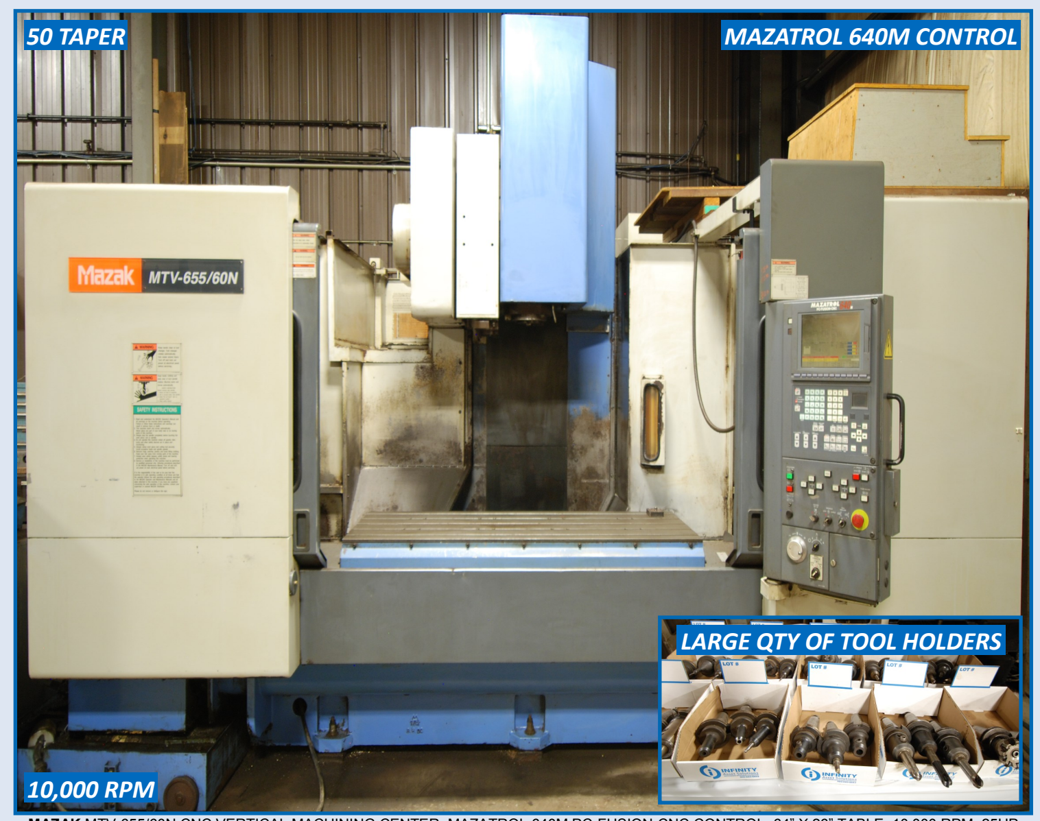
MAZAK MTV-655/60N CNC VERTICAL MACHINING CENTER, MAZATROL 640M PC-FUSION-CNC CONTROL, 64" X 26" TABLE, 10,000 RPM, 25HP SPINDLE, 30 ATC, TRAVELS: X-59.05", Y-25.59", Z-25.59", 50 TAPER, S/N 138408, JORGENSON CHIP CONVEYOR