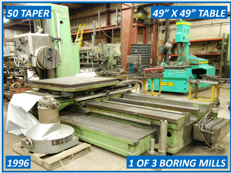
TOS MODEL W100A HORIZONTAL BORING MILL