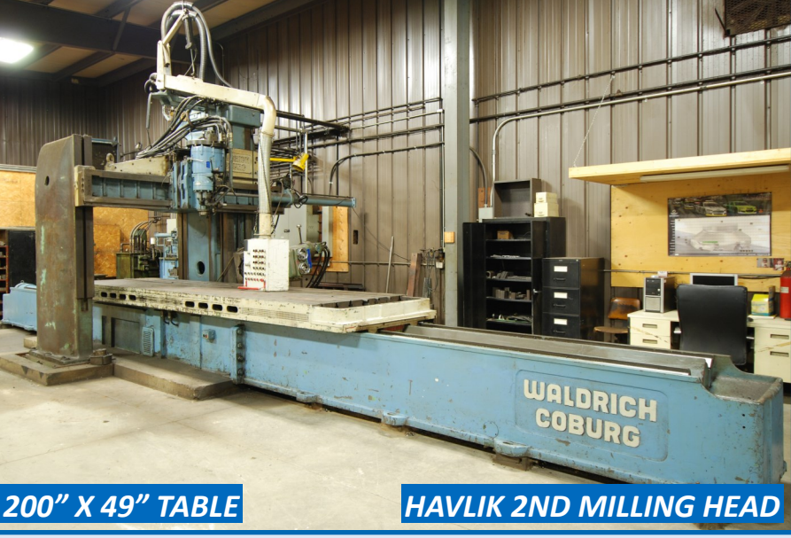
WALDRICH COBURG MODEL 6E PLANER MILL

Auction: Tuesday August 9, 11:00AM (ET) Inspection: Monday August 8, 9 AM to 4 PM