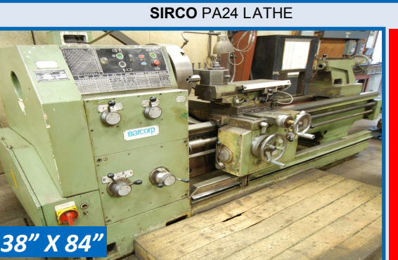
BULLARD VERTICAL TURRET LATHE