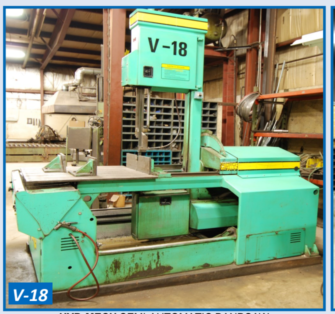
HYD-MECH SEMI-AUTOMATIC BANDSAW