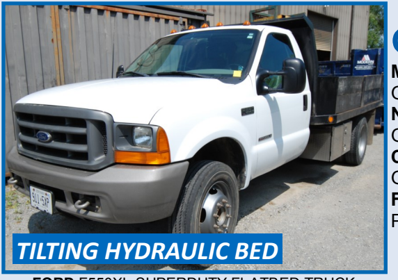
FORD F550XL SUPERDUTY FLATBED TRUCK