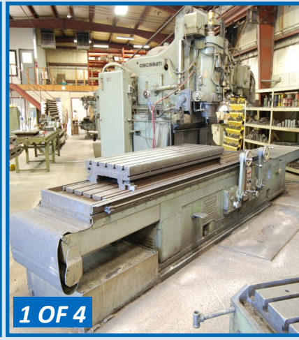
CINCINNATI VERTICAL MILL